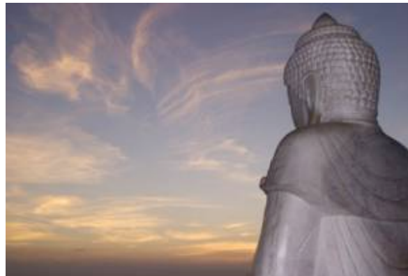
Buddha and Sky (Dodge, date unknown)